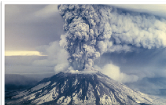
May 18, 1980, Mount St. Helens catastrophic eruption with 15-mile high column of ash.